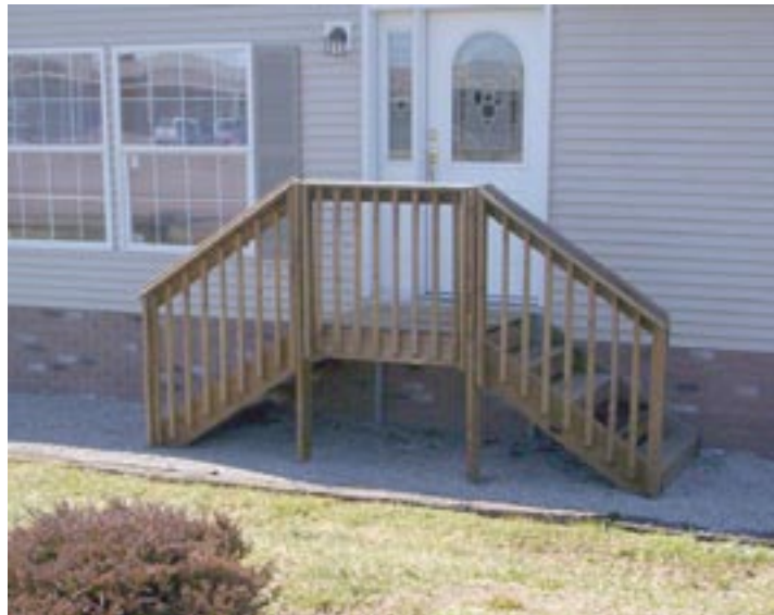
Assembly 205392 is pictured above, containing a top deck or "landing" plus four treads for a total of five "steps."